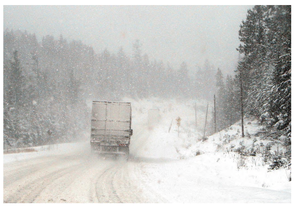
Figure 3. Small clouds of snow, ice, and slush thrown up by truck tires

Extreme weather conditions create several problems for sensors. Figure 3 illustrates one of them—the vulnerability of sensors to being obstructed by snow, ice, and slush thrown by other vehicles.