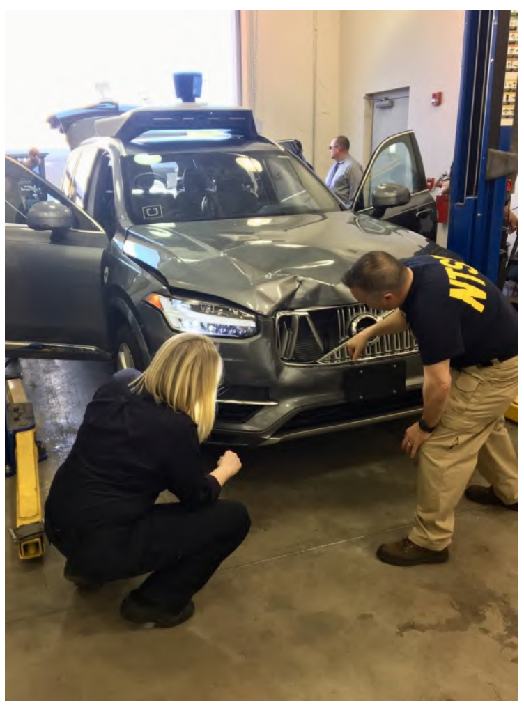
Figure 5. National Transportation Safety Board employees examine an Uber autonomous car involved in a fatal crash in Tempe, Arizona.

Illustrations of the political risk were common in the months following fatal SDC accidents involving Uber in Arizona and Tesla in California in 2018. See Figure 5. After these accidents, a US Senator wanted "to ensure semi-autonomous cars are also included in [an SDC-related] bill, that there are requirements for all of the vehicles to have a manual override and that there is more transparency with the data and safety evaluations" [50]. A Consumers Union specialist on SDCs, commenting on the bill, said, "We want to make sure that data is broadly shared to demonstrate their safety before the rest of us have to be guinea pigs sharing the road" [50].