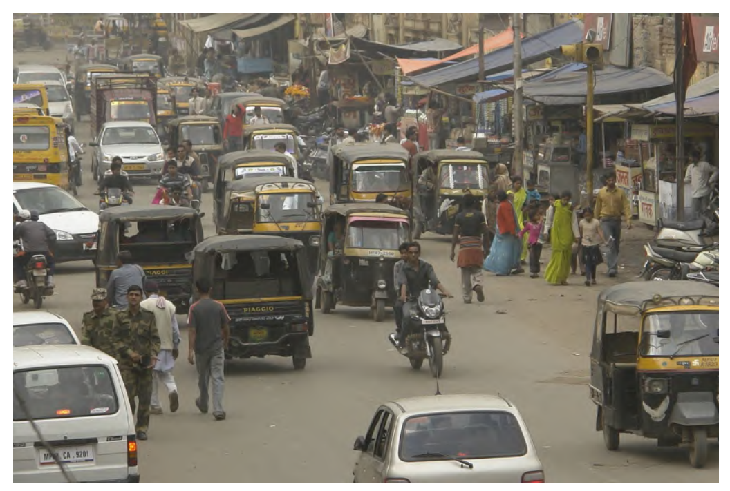
Figure 2. "People are able to use their commonsense understanding of the world ... to act sensibly in all sorts of new situations." Yibiao Zhao.

A third concern about deep learning algorithms is that it is impossible to trace the decision-making process the algorithm followed to achieve a final result. The deep learning algorithm is a black box with input and output terminals but with no display of what happens inside the box when particular input is transformed into output. An obvious danger here is the lack of a legal defense when an SDC is involved in a serious accident and a lawsuit ensues. SDC developers would have to admit that they have no idea how the deep learning algorithm arrived at the particular decision that led to the accident. What is more, even if the vehicle's software is modified to prevent the type of accident that triggered the lawsuits, the developers could not guarantee that deep learning would not lead to accidents in other driving situations.