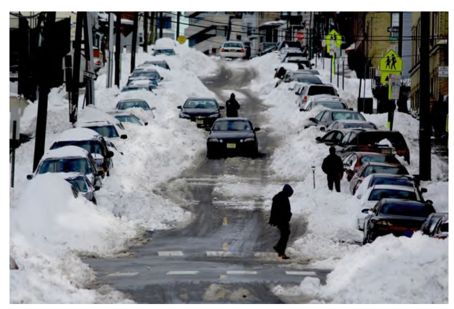
Figure 4. Shoveling out after a heavy snow

Cleaning the snow and ice from and around a car after a heavy winter overnight storm can take substantial time. Currently, Lyft and Uber avoid this problem because their drivers double as snow-removers, cleaning their own vehicles of snow and ice or keeping them in their own garage. But robotaxis will not have drivers, and thus a robotaxi company will have to keep a significant number of employees available at short notice for part-time snow removal work—after a snow or ice storm hits the area. This requirement will raise the cost of the robotaxi service in addition to being difficult for managers to administer.