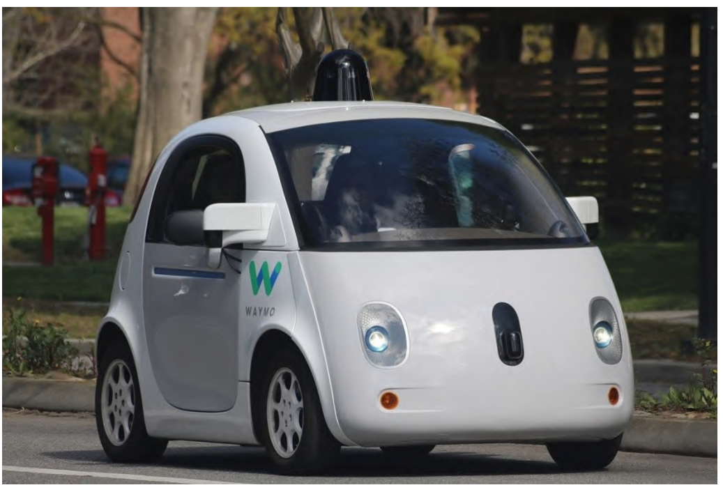
Figure 1. A self-driving car on the road in Mountain View, California