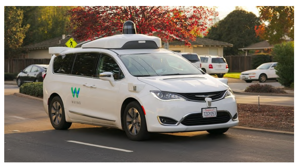
Figure 6. Waymo Chrysler Pacifica Hybrid minivan used as robotaxi in Chandler, Arizona.

Fleets of robotaxis and delivery vehicles are usually mentioned as the first applications of SDC technology to general-purpose driving. Ford is launching a fleet of pizza-delivery vehicles in Miami. Ford and GM plan to launch fleets of robotaxis in various cities, and Waymo already has [Figure 6].